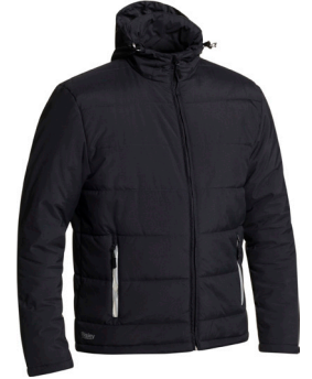
BJ6928 PUFFER JACKET w/ ADJUSTABLE HOOD