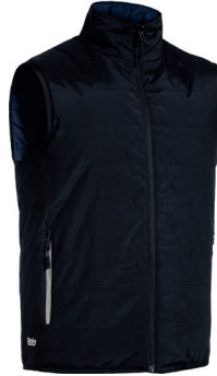
BV0328 REVERSIBLE PUFFER VEST