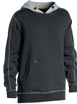
BK6922 FLX & MOVE™ CONTRAST HOODIE JUMPER